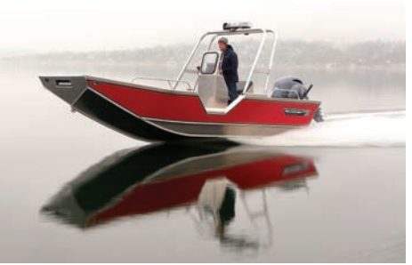
20' Skagit shown with agency options* *All boats pictured contain optional equipment