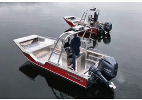
20' and 18' Skagit shown with agency options*