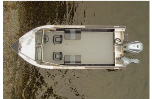
20' Sport Windshield*