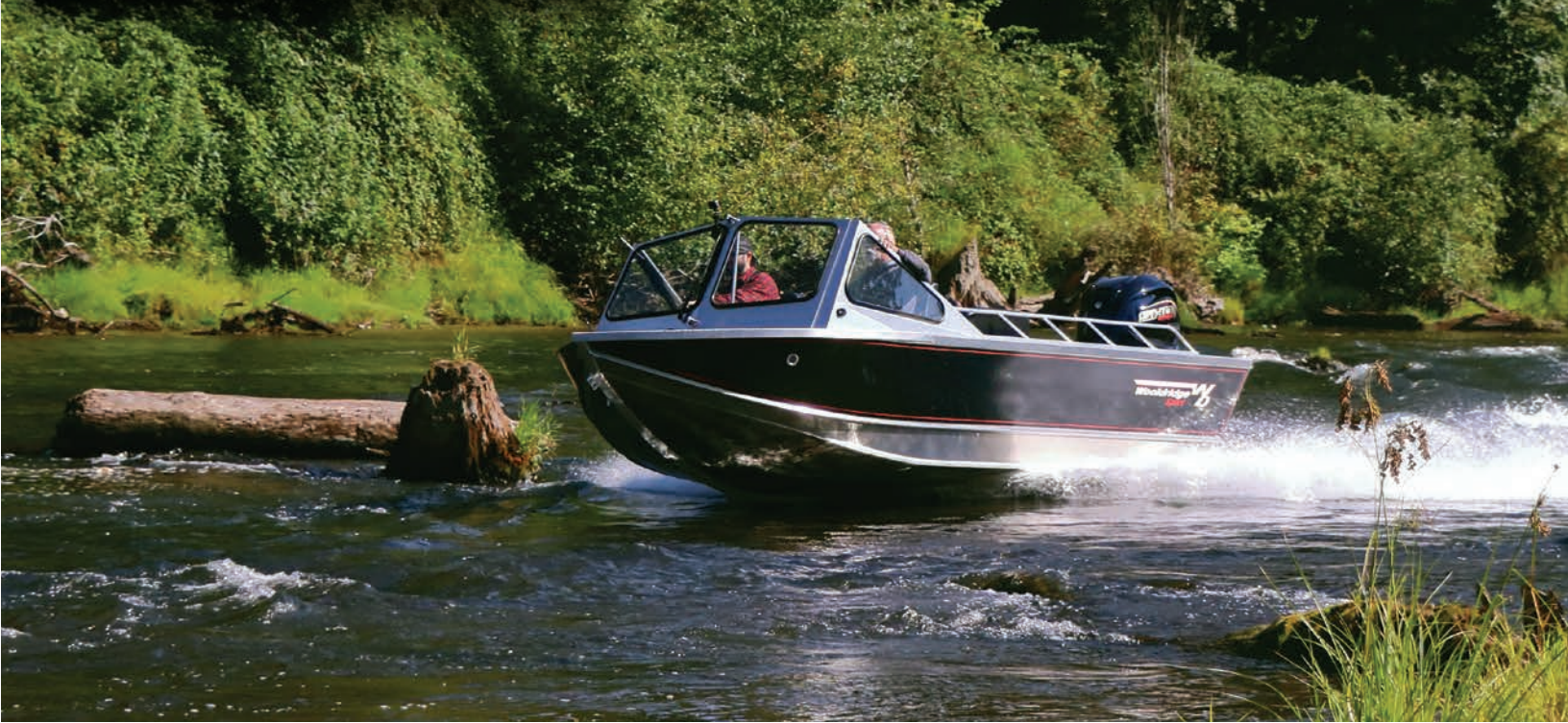
20' Sport Windshield