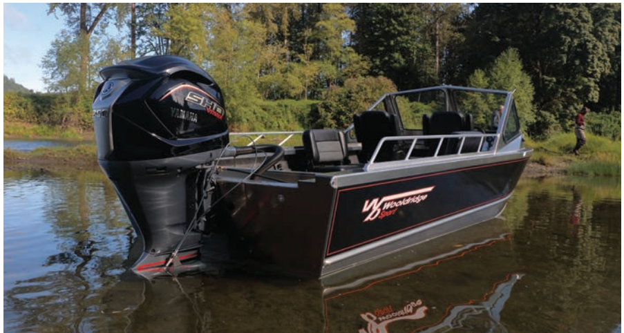
20' Sport Windshield*