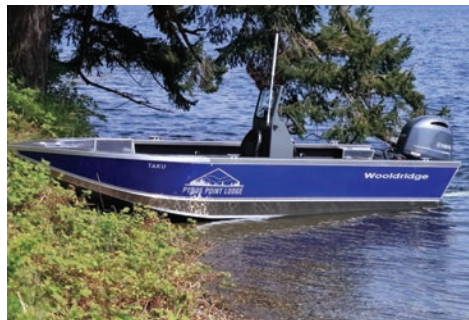
20' Sport Center Console*