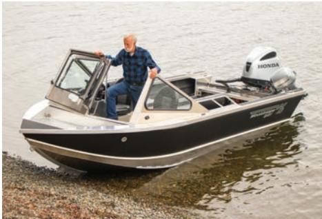
20' Sport Windshield*