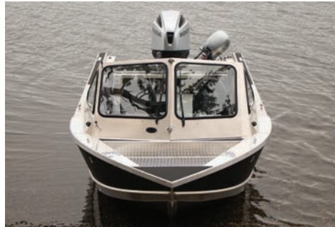
20' Sport Windshield*