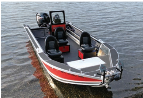
20' Sport Center Console*